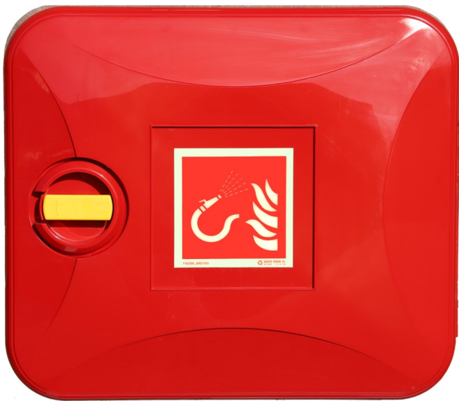
Shown fitted with Photoluminescent IMO Fire hose label