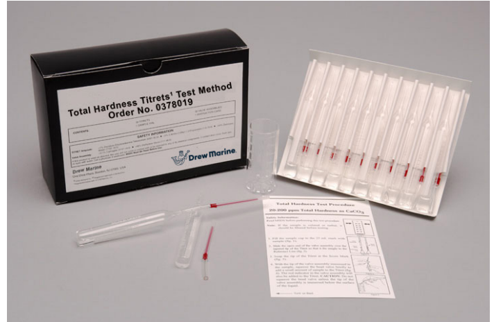
Total Hardness Titrets Test (PCN 0378019)