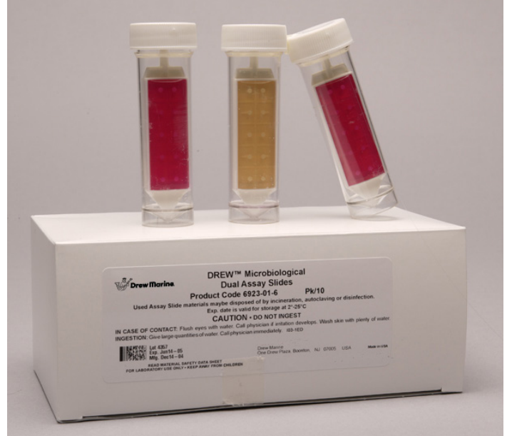
DREW Microbiological Dual Assay Slides PCN 6923016 10 Slides per box