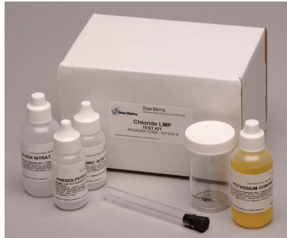
Chloride LMP Test Kit (Range 10-40 ppm and 100-400 ppm Chloride) PCN 0373019